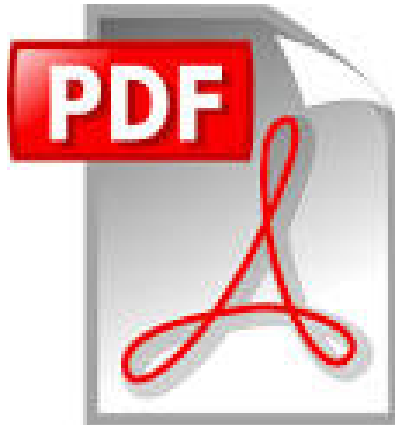
Original HPI form(s)