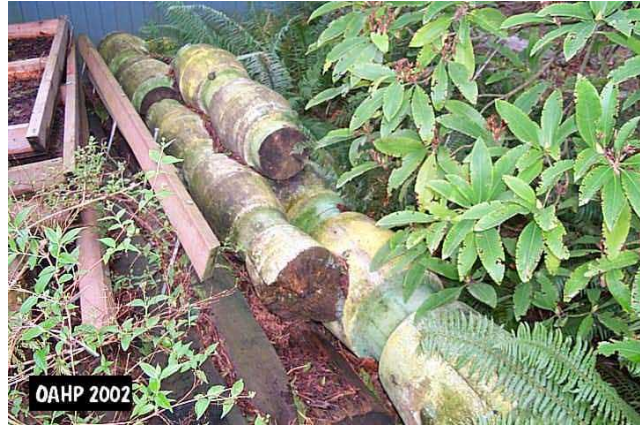
poles lying on ground