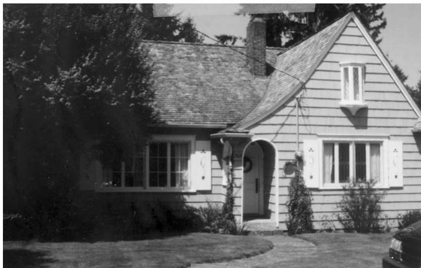
View of South Facade taken 7/1/1997 Photography Neg. No. (Roll No./Frame No.): 42-21 Comments: