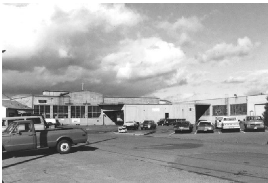
View of SW corner taken 10/11/1985 Photography Neg. No. (Roll No./Frame No.): 24-28A Comments: