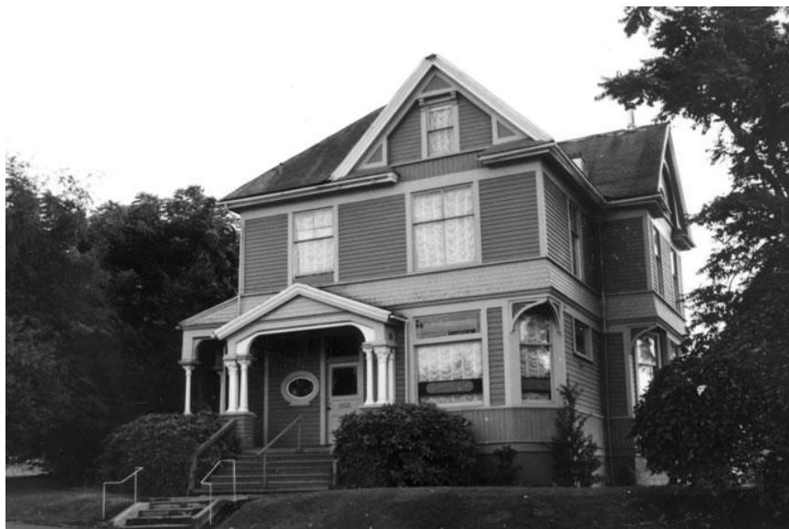
View of NW corner, west facade taken 9/11/1985 Photography Neg. No. (Roll No./Frame No.): 16-18A, 19